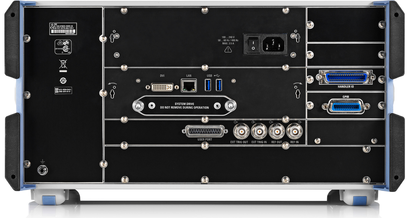
Rear view of the R&S®ZND